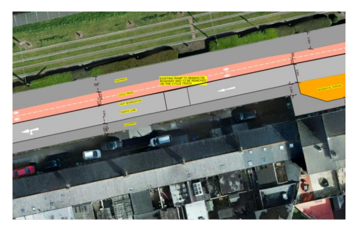
Figure 3 James's Walk Rialto St

The proposed cycle route will then run along James's Walk on the road in both directions while the road itself will become one way, running east to west towards Rialto Bridge.