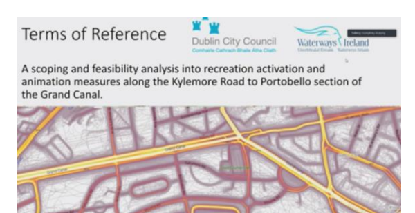
The Waterways Ireland report was discussed at the last area sub committee meeting.

Suggesting 7 nodal development points along the stretch of canal reviewed, one of the 7 nodes is Suir Bridge. No time scale included and it appears that a voluntary model is being suggested whereby a volunteer group will come in a operate water based activity at this base.