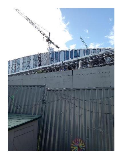
Figure 1 Back garden O'Reilly Avenue

For five years residents have had a section of their gardens removed with a steel fence boundary and beyond that a large 20 ft hoarding along the boundary of the site. See picture below.